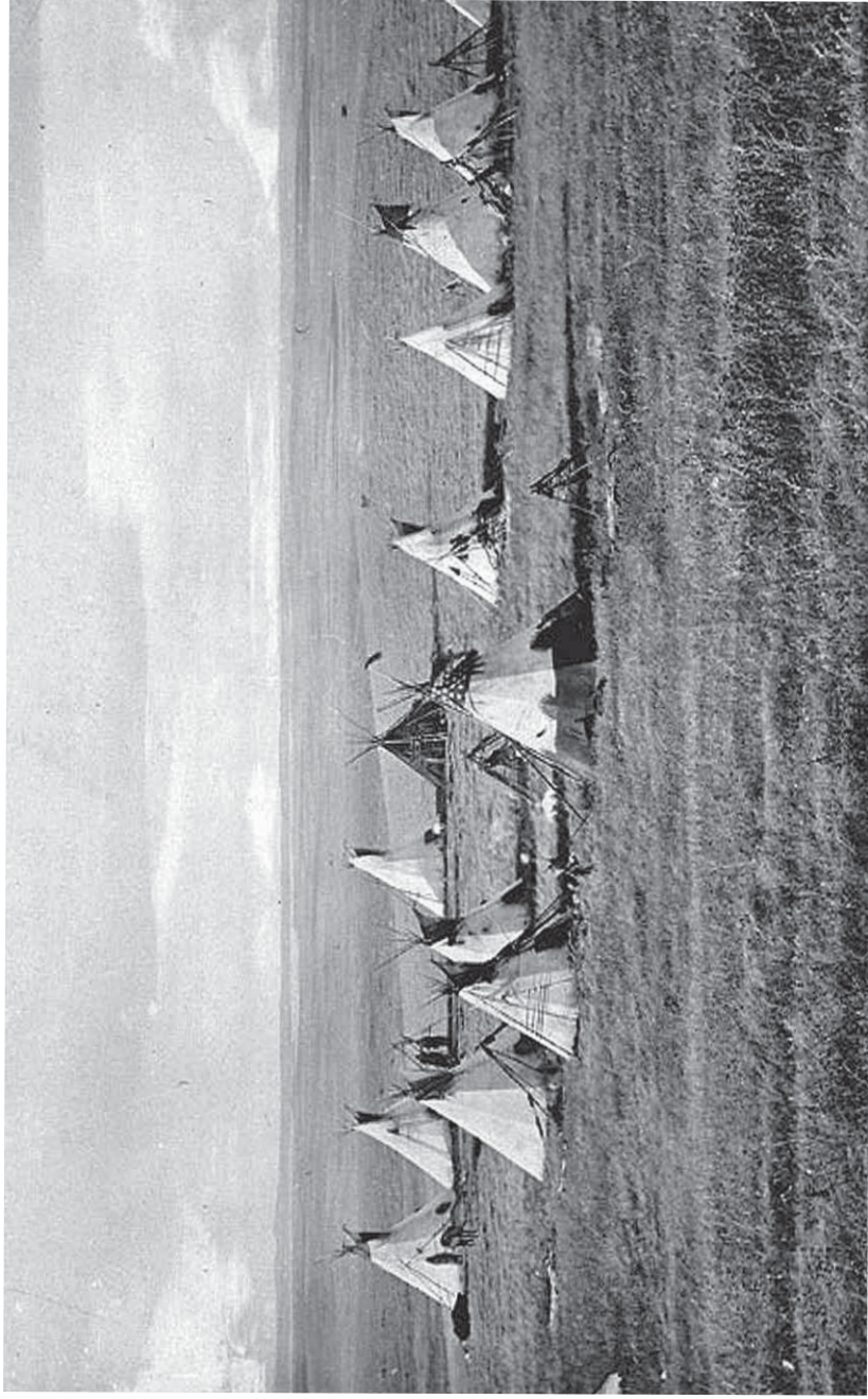
A Cree Camp in 1871 in Alberta, Canada